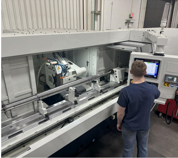
Precision cylindrical grinding of a turbine rotor can achieve OEM dimensional tolerances and surface finish.

For nearly 70 years, HFW Industries has been a trusted partner to the power generation industry , offering full-service capabilities in manufacturing and repair.